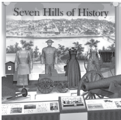
Pictured are concepts for the main courtroom gallery—interpreting the history of Lynchburg leaving room for groups and small events

The Old Court House was built in 1855 and is one of Lynchburg's architectural treasures, standing at the top of Monument Terrace. The building